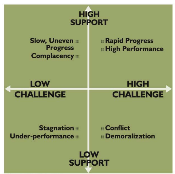
FIGURE 1 : APPROACHES TO REFORM

Observed best practices reflect a reform strategy that balances high challenge with high support.<sup>2</sup> (See Figure 1.) Historically, we've expected too little of our communities, our education professionals, and our students. Recently, we've expected too much with too little support. Maintaining a delicate balance between challenge and support is central to effective classroom, school, and district leadership.