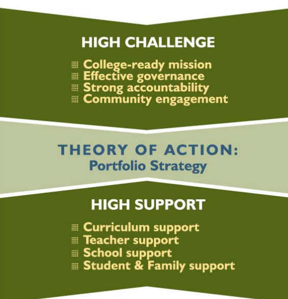
FIGURE 2: A HIGH-PERFORMING SCHOOL DISTRICT

Districts demonstrating improved results typically have a clearly defined improvement strategy, or more accurately, a collection of improvement strategies that constitute a theory of action. In many urban districts, these improvement strategies effectively combine the benefits of an aligned system with quality options-in other words, an aligned instructional system and school choice. Figure 2 shows the organizing framework for this paper: a system that combines highchallenge and high-support attributes around a theory of action. Michael Barber and Michael Fullan summarize it as the need to "integrate accountability and capacity-building, and do it systemically."<sup>4</sup> The emerging best practices are targeted at school districts, but many would equally apply to state policy. It's critical that district and state policies be aligned to provide consistent signals and coherent support to schools.