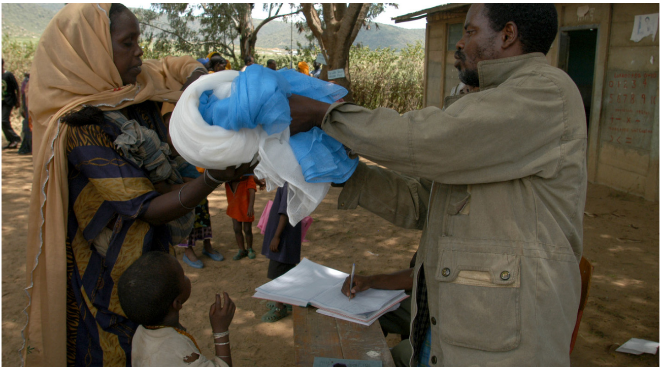
Women receive mosquito nets in the Babile district, Ethiopia.

The world is also making progress in preventing pneumococcal disease (pneumonia, meningitis, and sepsis), the leading cause of vaccine-preventable death for children under 5. Earlier this