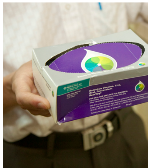
Rotavirus vaccine for distribution at Dong Anh District Hospital, Hanoi, Vietnam.

The lessons learned from the pneumococcal AMC will guide decisions about potential future AMCs for other diseases, such as malaria and tuberculosis.