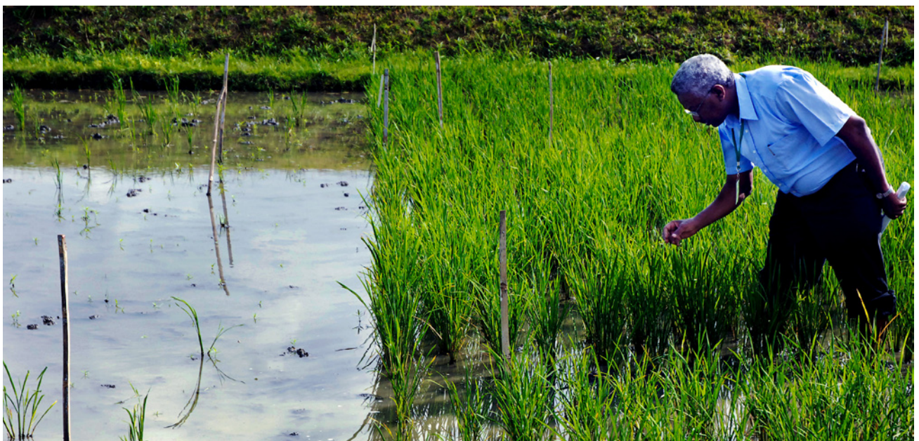
A researcher at IRRI inspects flourishing flood-tolerant rice varieties (right), planted next to traditional varieties, Los Baños, Philippines.

IRRI and its partners have already helped develop and distribute hundreds of tons of improved rice seeds to farmers, and they are working closely with farmers, governments, and the private sector so that many more poor rice farmers are able to improve their food security and increase their incomes.