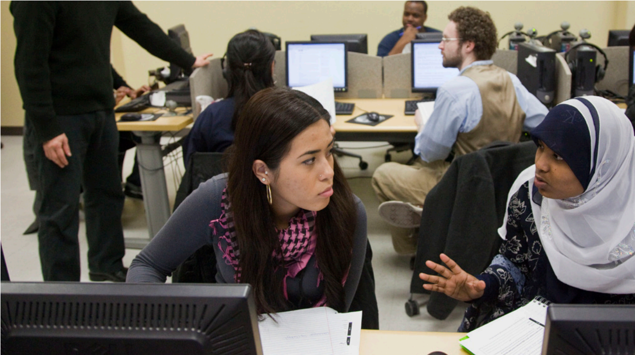
Students in a broadcasting class at LaGuardia Community College, New York, N.Y.