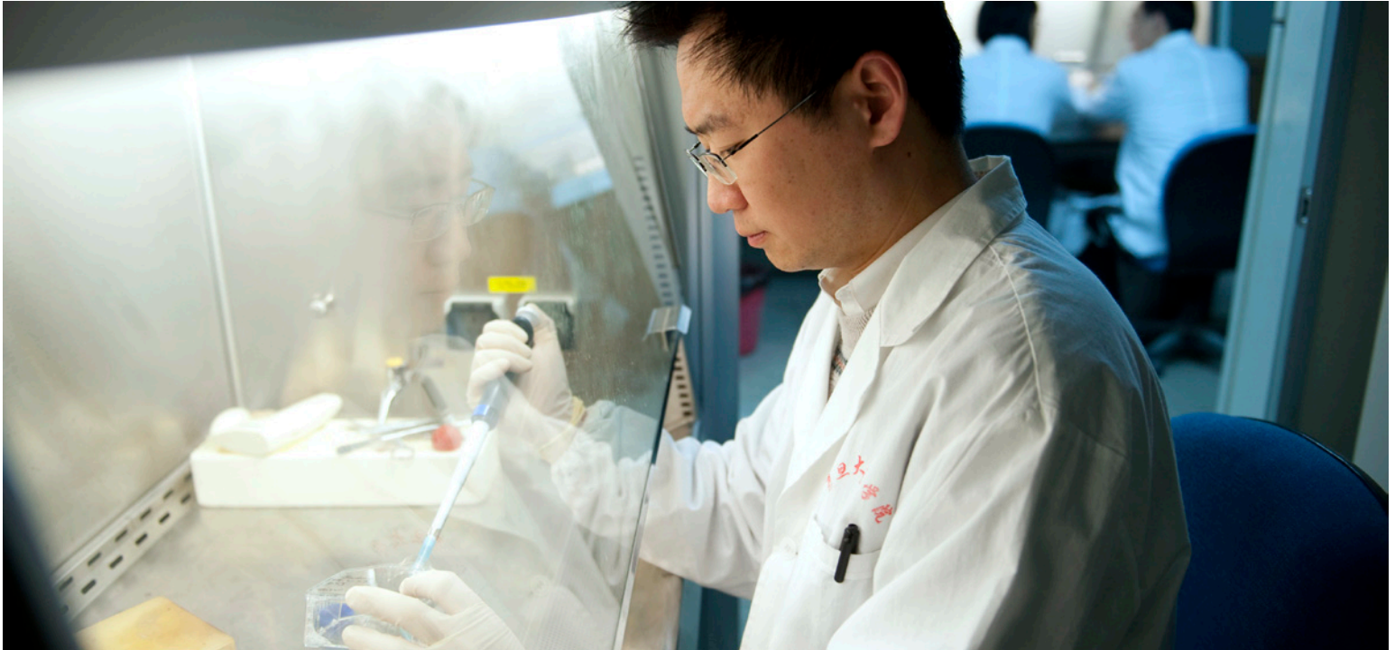
A student conducts research at the Institute of Biomedical Science, Fudan University, in Shanghai, China.

We have been working in global health for almost a decade. The results we are seeing from our investments—and from the investments of other funders, who are focusing more than ever before on the health of people in poor countries—prove one thing: Global health spending works.