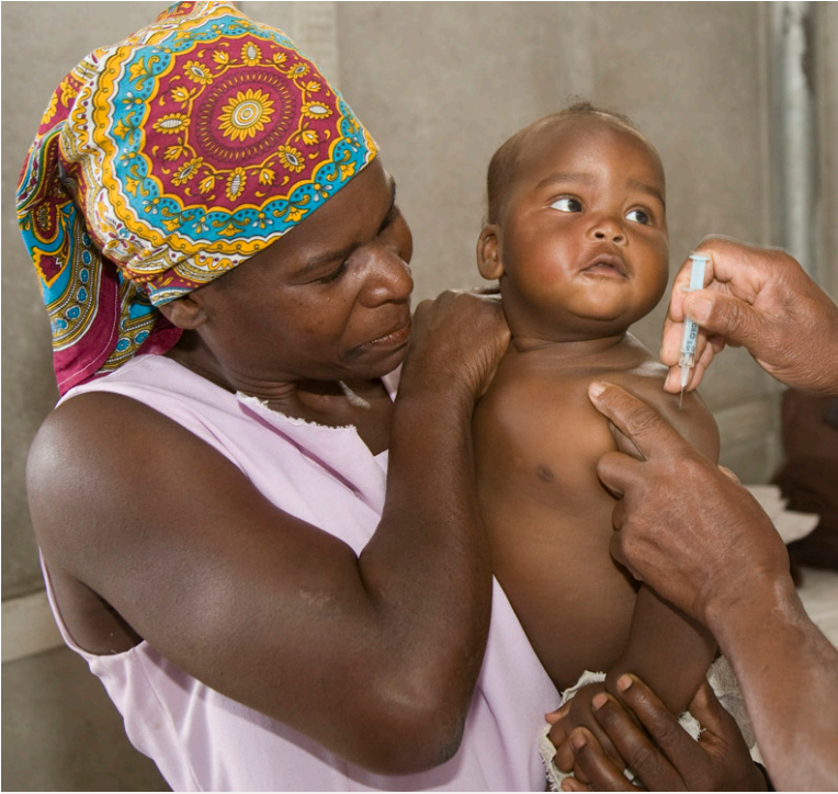
A child receives vaccinations at Manhiça Health Centre, Mozambique.

year, with a vaccine donation from Wyeth, Rwanda became the first low-income country to introduce the pneumococcal vaccine. The list of developing countries approved by GAVI for pneumococcal vaccine is now at 11, and 30 more have expressed interest in partnering with GAVI to introduce the vaccine.