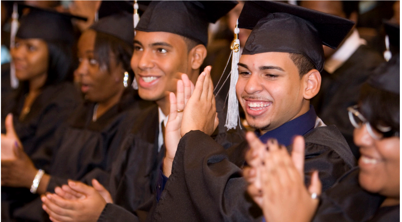
Graduation for students of Bronx Lab School, a foundation-funded high school in New York, N.Y.

This is an important milestone as states move together toward adopting more rigorous education standards that will help their students graduate prepared for college-level work. Working through the Council of Chief State School Officers, Achieve, and NGA, many state leaders have committed to raising standards.