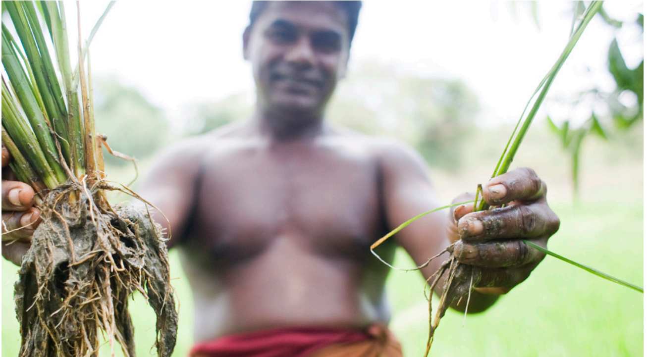
A farmer in Yahmagala East, Sri Lanka, who received seeds and training from Mercy Corps, shows how his new crop (left) is outperforming his old crop.