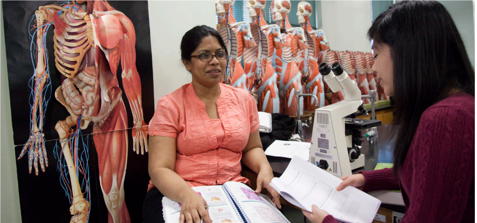
Biology students at LaGuardia Community College, New York, N.Y.

In the United States, we work toward one overarching goal: more opportunity for everyone in this country. Bill and Melinda Gates believe an excellent education is the most direct path to opportunity, especially for low-income young people, so that is the focus of our efforts.