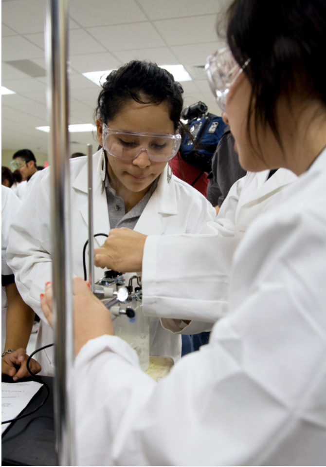
Students in a chemistry class at Hidalgo Early College High School, Hidalgo, Texas.