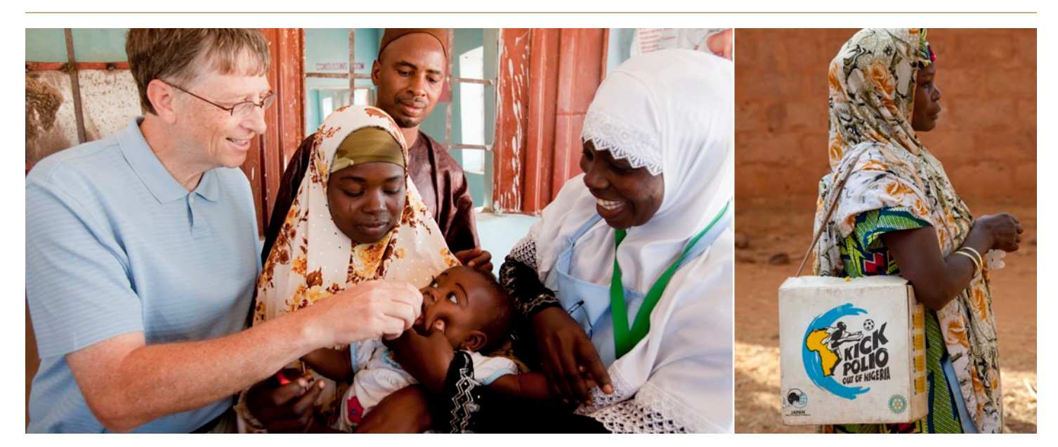
From left: Administering polio drops to a child during a visit to a Bini health clinic (Sokoto, Nigeria, 2009); woman delivering vaccines house-to-house on Immunization Plus Day (Sokoto, Nigeria, 2009).

substantially, and other partners have now taken the lead on the large-scale delivery of these interventions. There has been a dramatic increase in bed net usage thanks to donations from individuals (some through church organizations and Nothing But Nets), the Global Fund, and rich governments. The countries that have had these interventions in wide-scale use for several years are seeing large reductions in malaria deaths: Rwanda has seen a 45 percent decline, Zambia 50 percent, Cambodia 50 percent, Eritrea 80 percent. These interventions are being scaled up rapidly, which will have a big impact.