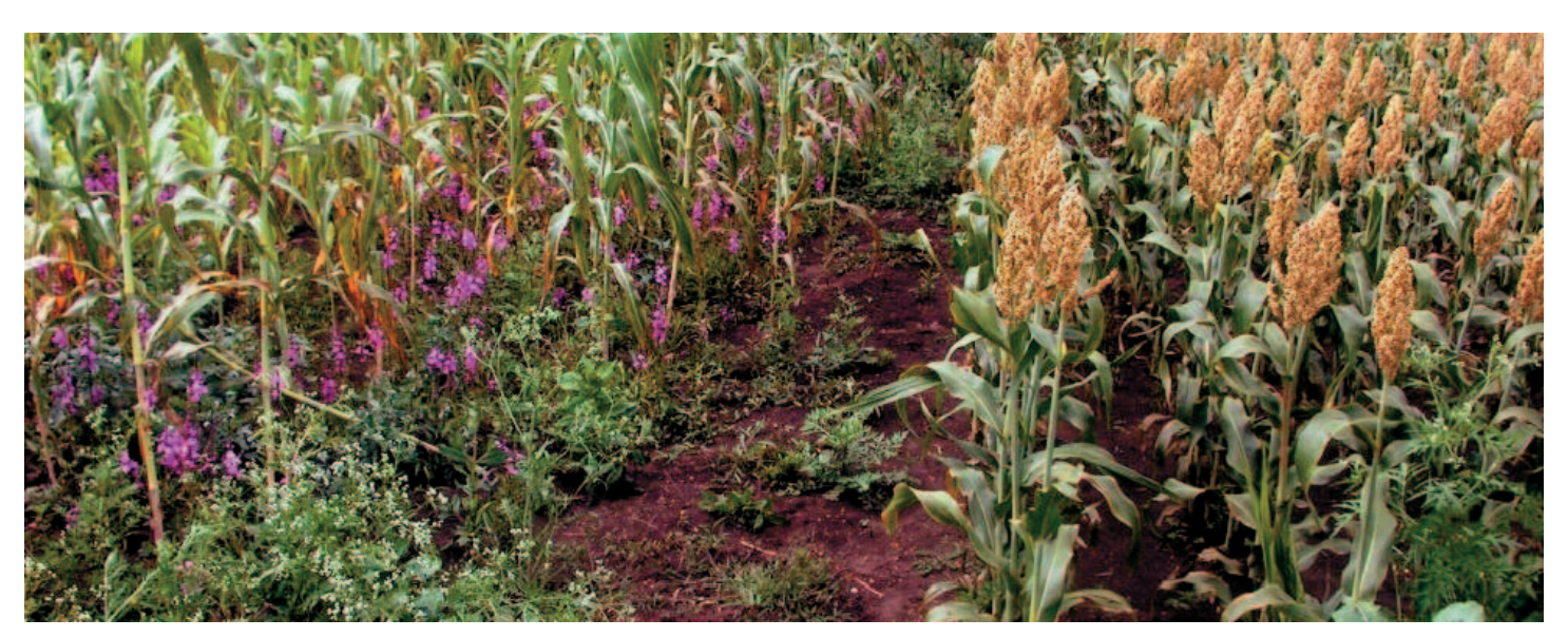
A high-yield, Striga-resistant variety of sorghum (right) growing alongside a nonresistant variety infested with Striga (purple-flowered plants) (Fedis, Ethiopia, 2006).

The picture below shows you what a dramatic difference this kind of work can make. On the left you see sorghum that has been attacked by Striga , a devastating parasitic plant. On the right you see high-yield sorghum that has genes to prevent Striga from attacking. The difference to a small farmer between having the old seed and the new seed is the difference between starving and thriving.