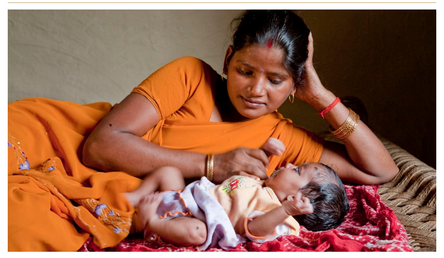
Mother with her one-month-old girl in the village of Rampur Ashu (Uttar Pradesh, India, 2007).

other causes, and still make no progress in preventing neonatal deaths, they will soon represent 60 percent of all deaths for children under 5.