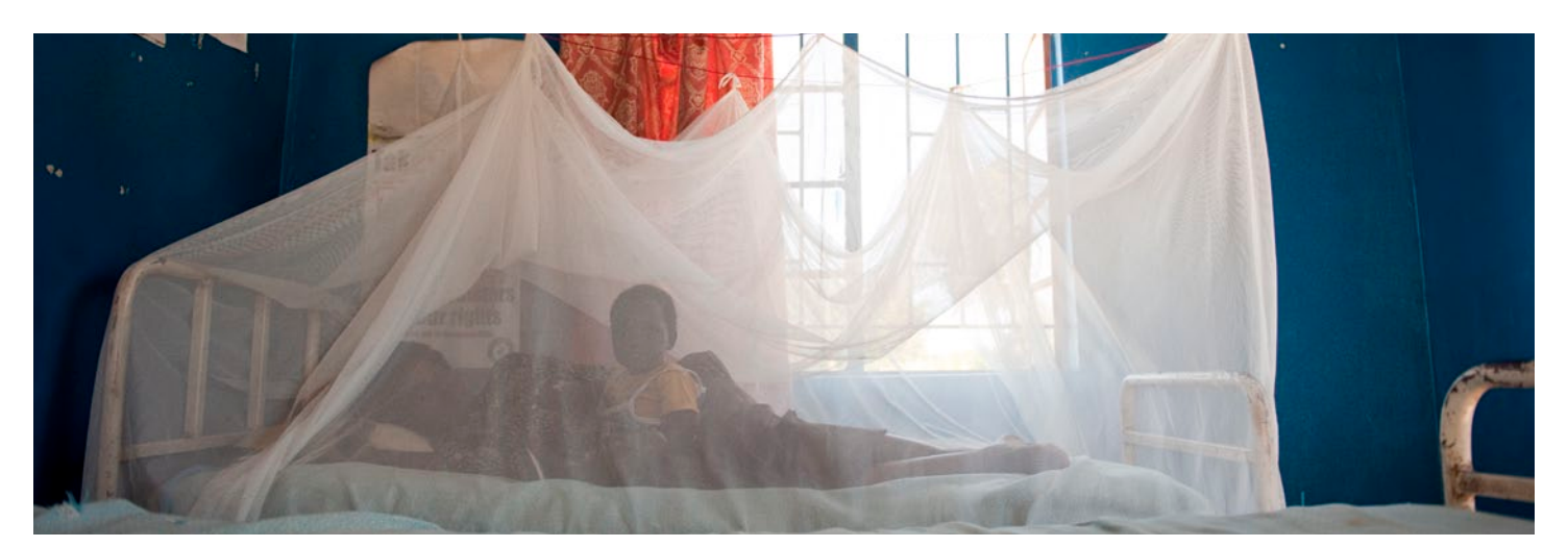
Mother and child resting under an insecticide-treated bed net (Chongwe District, Zambia, 2009)

Two years ago, Melinda and I challenged the health field to set a goal of eventually eradicating malaria. Because it is such a widespread disease, the foundation has backed a number of different types of innovations. In 2005 we helped fund a medium-risk pilot project in Zambia to test having most people in an area sleep under insecticide-treated bed nets and spray the inside of their house with insecticides. These interventions have proven to reduce malaria